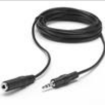
A062 - 10' AC Adapter Extension cable for R157 AC Adapter