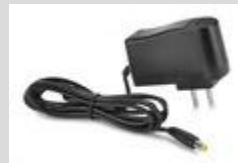
R180 – Replacement AC Adapter