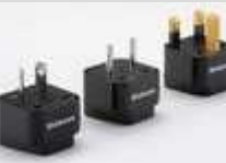
R066 - Universal Plug Kit International kit for Data Loggers