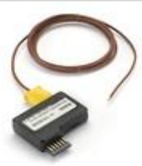
R400 -Replaceable Sensor Single K-TC Temperature Sensor