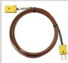
A202 – Thermocouple Extension K-Thermocouple 100'(30m) Extension Cable