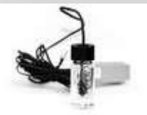
A340 - Glycol Bottle Bottle of Glycol Solution w/ Septum Close