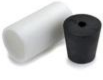
A868 - Sensor Dust Filter Prolong the life of your sensor