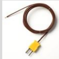
R013 - Temperature Probe Replacement Bead Wire Temperature Probe